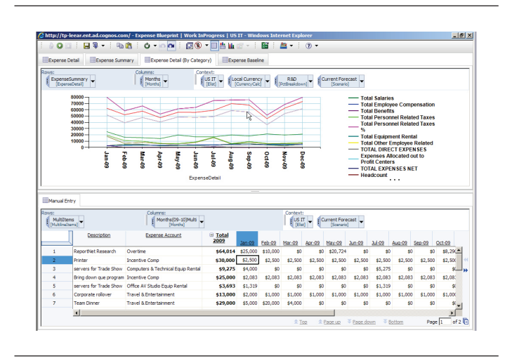
Charting and the ability to change entries in the charts dynamically enable informed decisions.

Cognos TM1 is readily adaptable for high levels of participation. You deploy your planning activities in Microsoft Excel or a managed application in the contribution interface. These "experiences" enable advanced, on-demand analysis but require minimal training, no programming skills and minimal IT assistance.